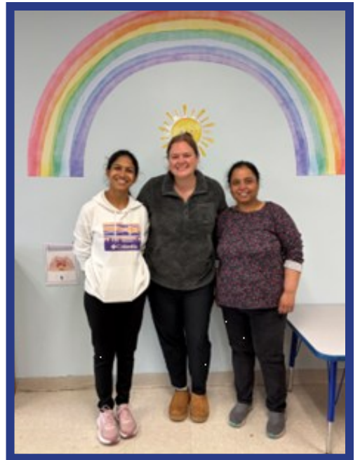
Lovely Lane Preschool Support Staff left to right