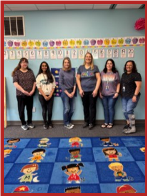
Lovely Lane Preschool Teaching Staff left to right